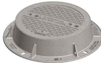
Type A solid cover illustrated

Heavy duty Machined bearing surfaces Options Solid or vented covers Custom logo covers Grates Gasket seal covers Adjusting risers Hinged unit