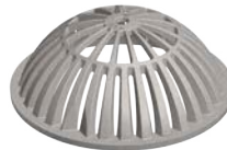
Type O3 9" Tall Beehive Grate Approx. 163 sq. in. open area