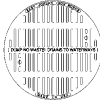
1040M3 ADA Grate Heavy duty Approx. 130 sq. in. open area